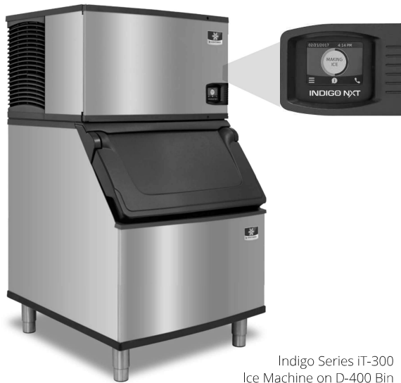
Indigo Series iT-300 Ice Machine on D-400 Bin *Ice Machine and Bin sold separately

LOW PROFILE MODEL ONLY 16.5" (42 cm) HIGH