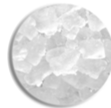
Ice shown actual size

Nugget ice consists of small pieces ranging from 3/8" to 1/2" in width and length on average. Offers a 85% ice to water ratio with a soft, chewable texture while still providing maximum cooling effect and great dispensibility.