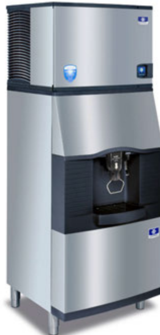
Indigo NXT iT0450 Ice Machine SFA-292 Ice & Water Dispenser (Ice Machine and Dispenser sold separately)