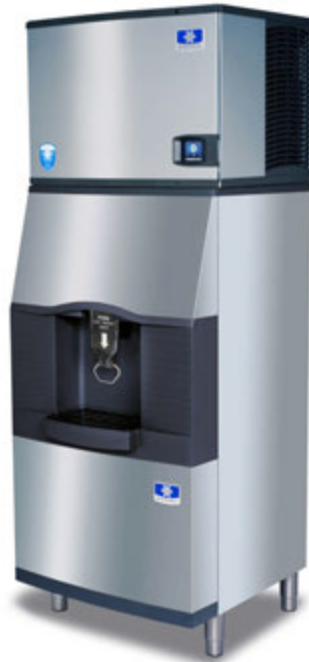
Indigo NXT iT0450 Ice Machine SPA-312 Ice Dispenser (Ice Machine and Dispenser sold separately)

Clearance from grate to bottom of the chute 9.5" (24.13 cm)