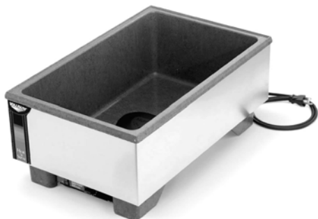
Model 1220 Full-Size Heat 'N Serve Merchandiser