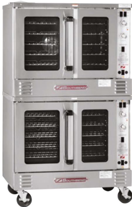
(SB0120DF shown with optional casters)