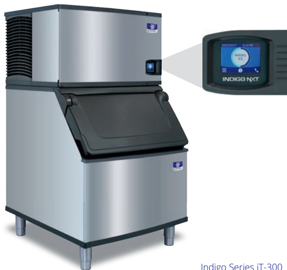
Indigo Series iT-300 Ice Machine on D-400 Bin