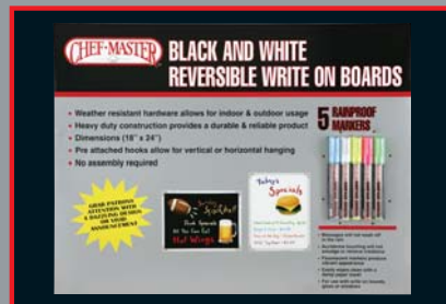
90030 SMALL BOARD 18 X 24