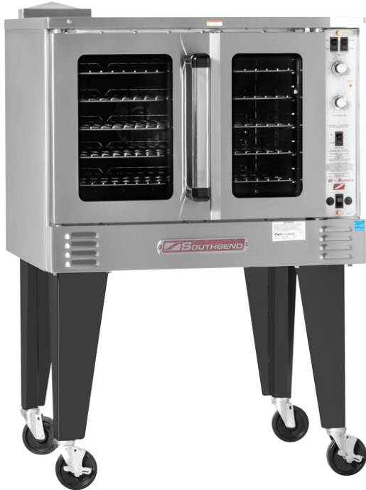
(SB0110DF shown with optional casters)