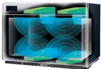
Top & Bottom Energy Feed