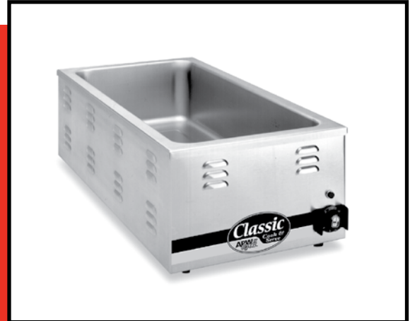
MODEL W-43V COUNTERTOP WARMER