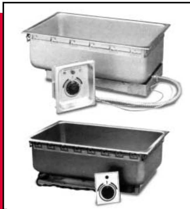
Top Mount Hot Food Well