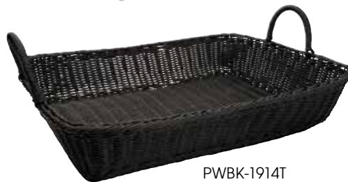
PWBK-1914T 19"L X 14"W X 4"H