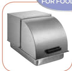
Closed on a food pan