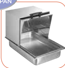
Open on a food pan