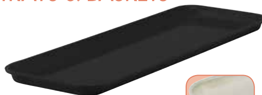
FGMT-0926K 26"L X 9"W