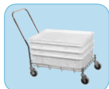
Transport dough boxes