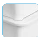
Seamless fit for extra fresh storage needs