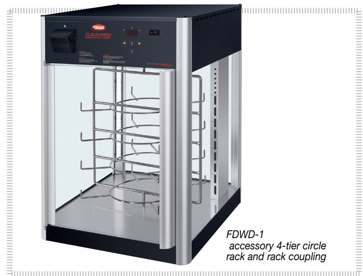
FDWD-1 accessory 4-tier circle rack and rack coupling