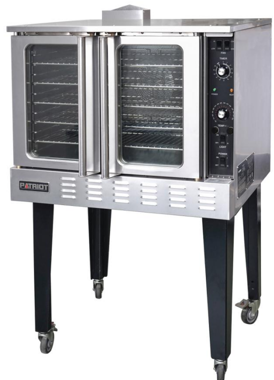
Electrical Specifications - Per Section