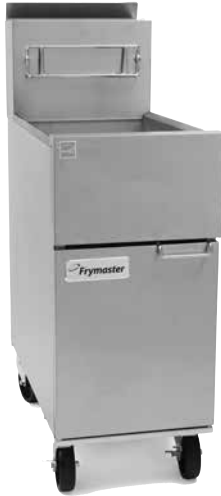
ESG35T Shown with optional casters.