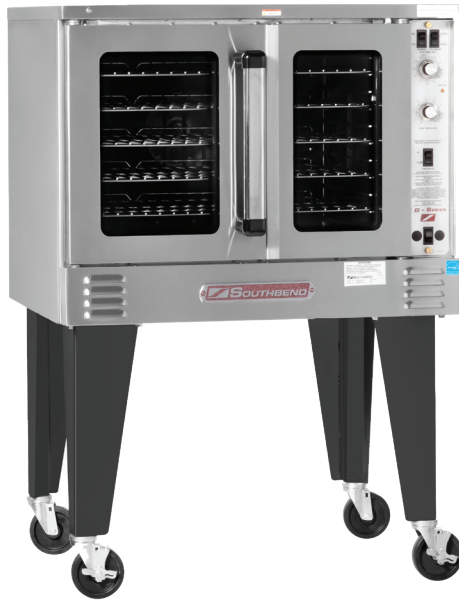
(SB1220DF shown with optional casters)