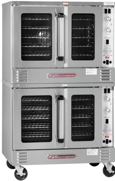
(SB1322DF shown with optional casters)