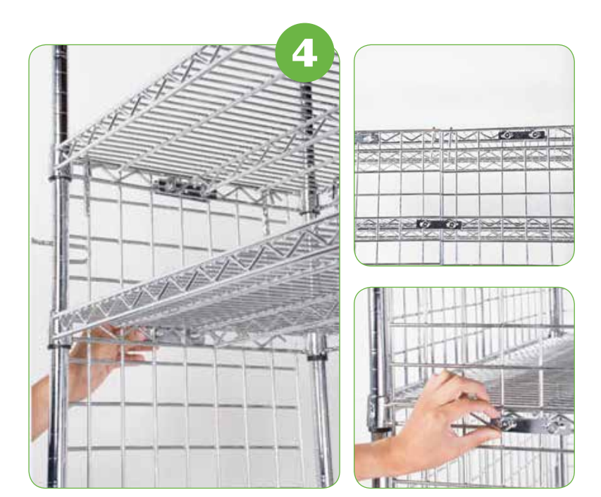
Feed connectors through panels and underside of shelf to secure cage to shelf.