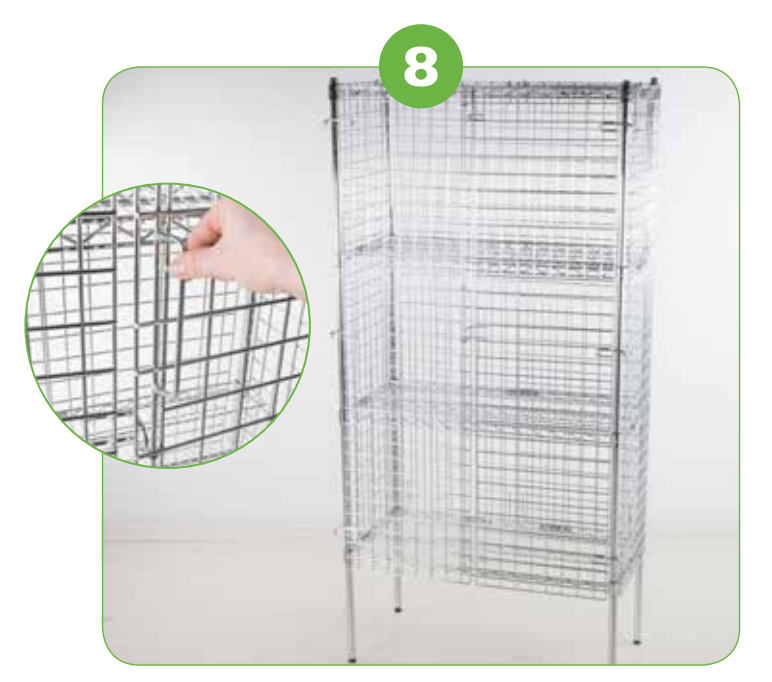
Close the door and lock it. Assembly complete!