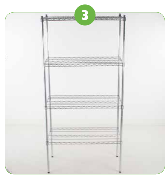
Attach the two back and two side panels to shelves. Be sure that panel hooks go through the shelves.