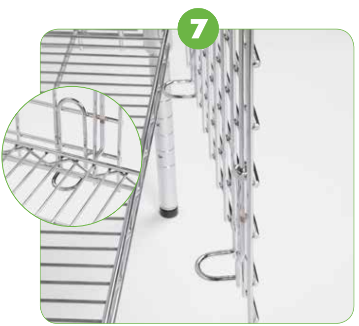
Check the foot pieces that extend beneath the bottom shelf to prevent the door from being removed.